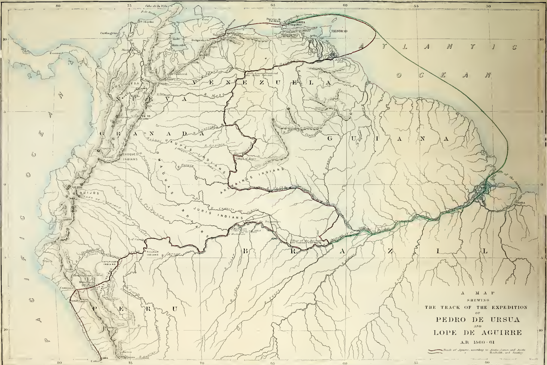
A MAP SHEWING THE TRACK OF THE EXPEDITION OF PEDRO DE URSU AND LOPE DE AGUIRRE A.D. 1560-61

Track of Aguirre, according to Acosta, Ovando, and others Humboldt, and Sauthey